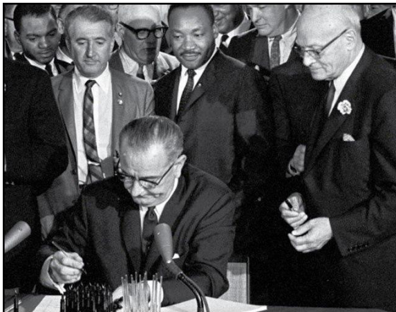
Aug. 6, 1965, Washington, DC. President Lyndon Johnson signing the Voting Rights Act, as Rev. Dr. Martin Luther King, Jr. looks on.